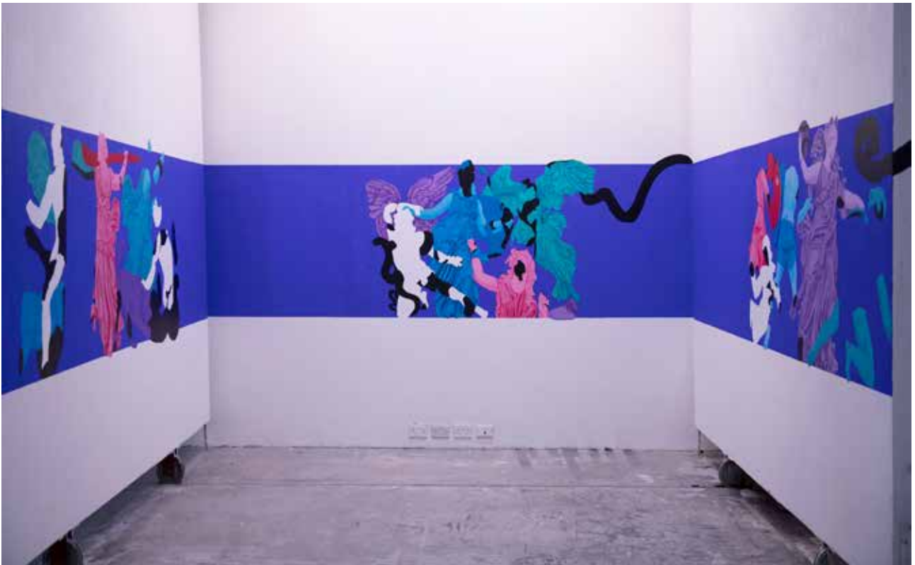
Pergamonium, 2021 Acrylic, 37' 4" x 4'