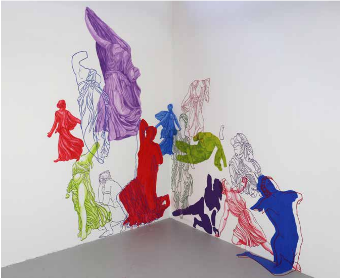
Untitled (Agora), 2021 Acrylic, 16' 5" x 11'