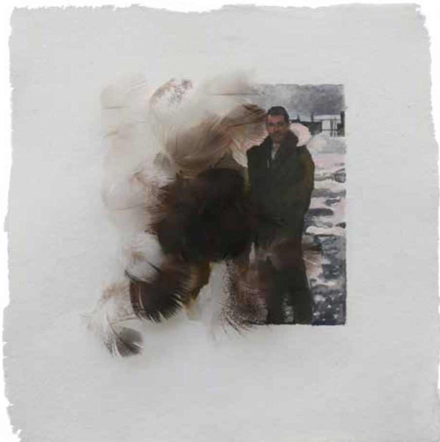
Iceland 1992, 2021 Watercolour, gouache, feathers