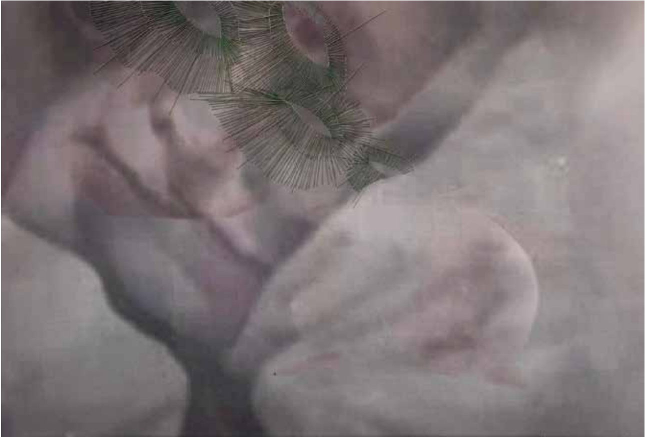
3 AM, awake , 2021 Film photograph printed on bedsheet, embroidery thread