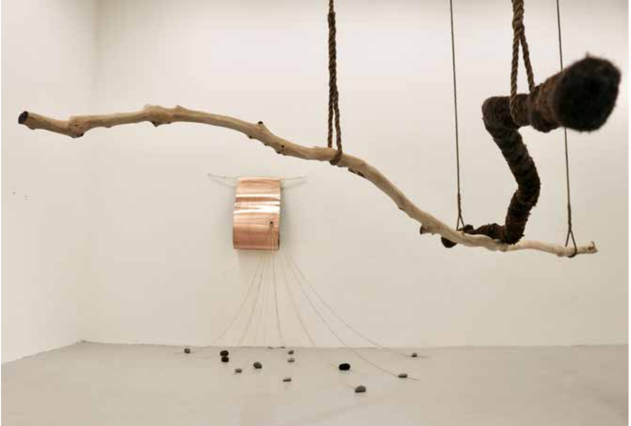
Flesh of the World, 2021

Locally sourced raw sheep wool, sheep intestines, hand harvested hazel, reclaimed copper