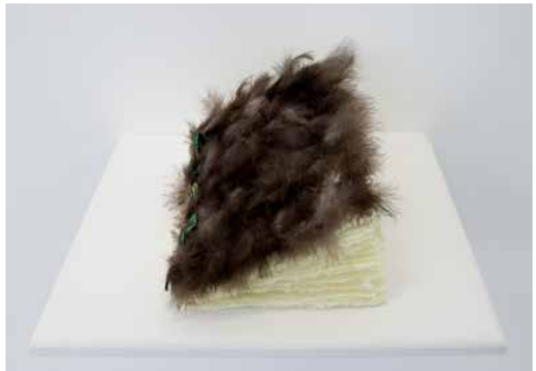
Feather Bound, 2021 Mixed media