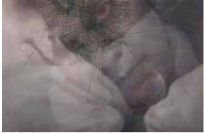
7 AM, still awake , 2021 Film photograph printed on bedsheet, embroidery thread