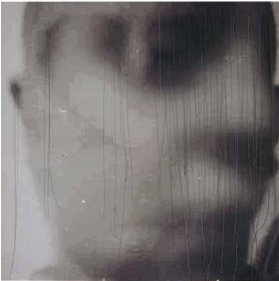
2 PM, exhausted , 2021 Film photograph printed on bedsheet, embroidery thread