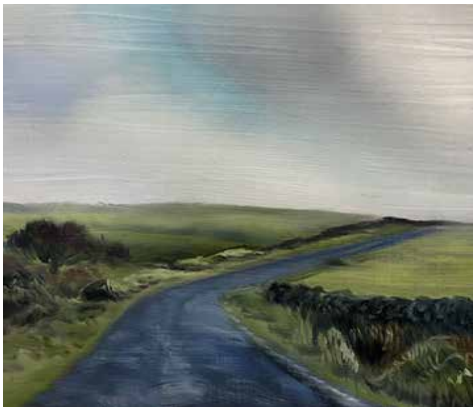
Mt. Gleninagh, 2021 Oil on panel