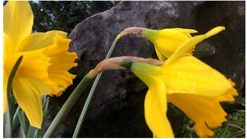
February 23, 2021 Night Run, Second Commute - film still