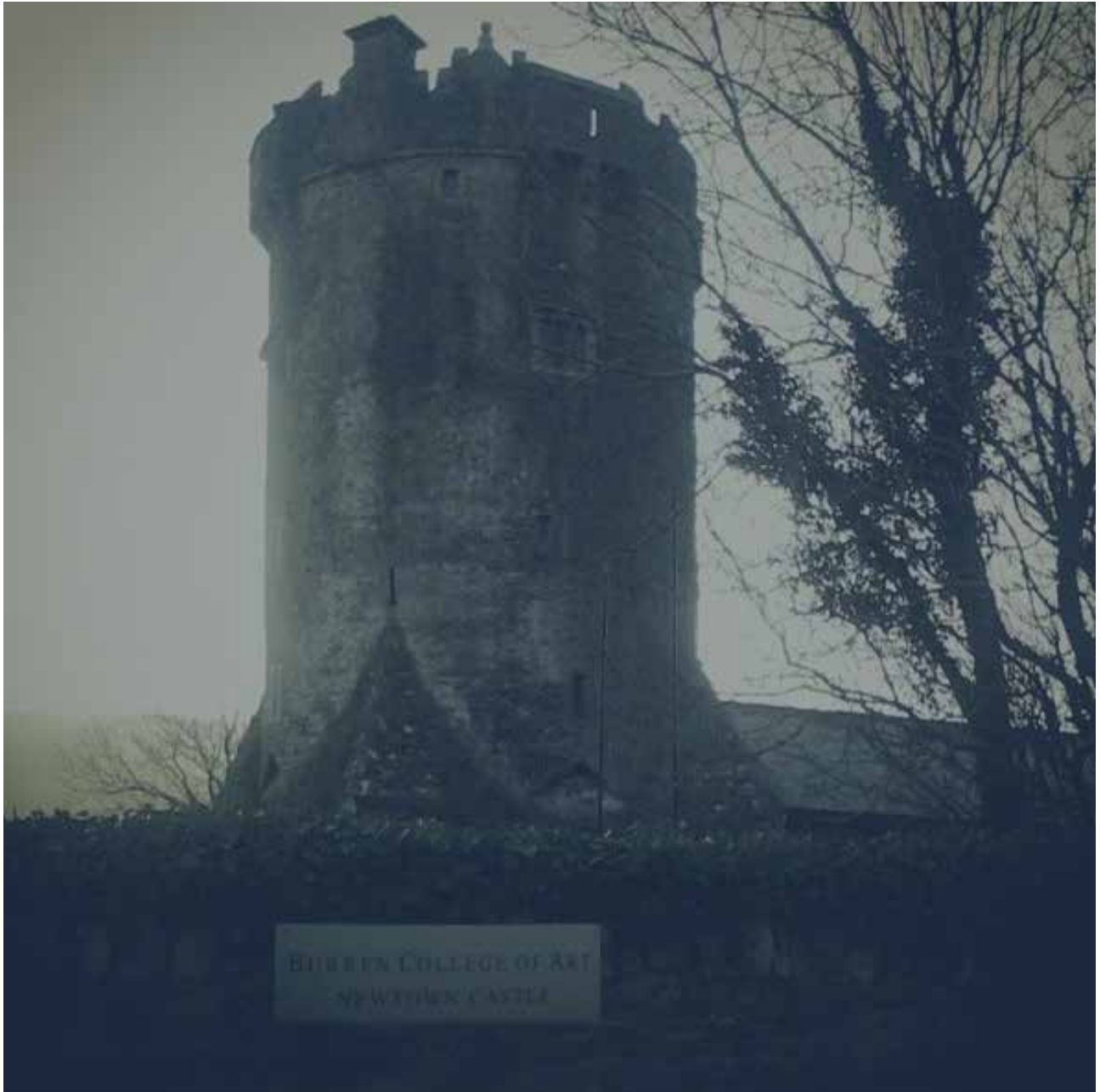
BIRR COLLEGE OF ART NEW TOWER CASTLE