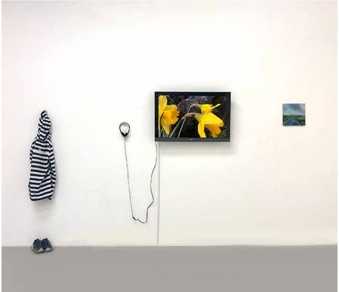
Installation Details, 2021