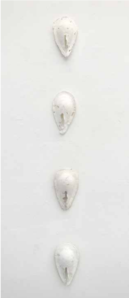
Laurelle's Plane, 2021 Handmade paper with beeswax, gold leaf and earl grey tea